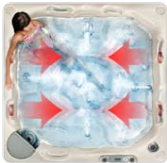
Beachcomber's QSS™ Surround Sound System

Beachcomber's Quintessential™ Surround Sound System is contained within the hot tub's acrylic shell. You can actually feel the music. It is like being at a live concert and relaxing in the comfort of your Beachcomber Hot Tub at the same time. Your body and the sound from Quintessential™ become one, bringing you closer to your favorite music than you ever imagined. Quintessential™ is a unique concept that allows you the unique combination of relaxation and sound therapy to make you feel good all over.